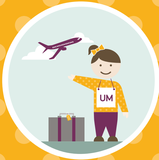
Fiona travelling alone